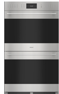
Wolf E Series Ovens

$250 REBATE - E Series Built-In Single Oven $500 REBATE - E Series Built-In Double Oven