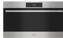
Wolf Convection Steam Ovens $400 REBATE - 24" and 30" Legacy Models

Qualifying Wolf Cooktops, E Series Built-In Ovens, Convection Steam Ovens, and Cove Dishwashers must be purchased between April 1, 2023 – November 30, 2023 to be eligible to receive a rebate on a Prepaid card. New Wolf Convection Steam Ovens do not qualify (CSO2450 and CSO3050 models). Products must be delivered, installed, and redeemed by March 31, 2024. No late submissions will be accepted. All claims must include a copy of the original sales receipt or invoice, serial number(s), and model number(s) and be submitted to subzerowolfpromotions.com . Rebate is valid on purchases at all Sub-Zero, Wolf, and Cove authorized Retailers in Arizona, New Mexico, Southern Nevada and El Paso, TX. Purchases in other areas or at non-authorized Retailers do not qualify. Sub-Zero Group Southwest is not responsible for lost, late, or illegible entries. All claims are subject to audit. Please allow 3-4 weeks to receive your Prepaid card once your claim has been approved. Builder and wholesale purchases do not qualify. Can be combined with other offers. Cards are non-transferable and cannot be redeemed for the cash value. Please retain a copy of your submission and invoice for your records. Reward paid via Prepaid card in US dollars. The card is issued by the Bancorp Bank, Member FDIC, pursuant to a license from Visa U.S.A. Inc. Please pay attention to the expiration of your card and the card's terms and conditions.